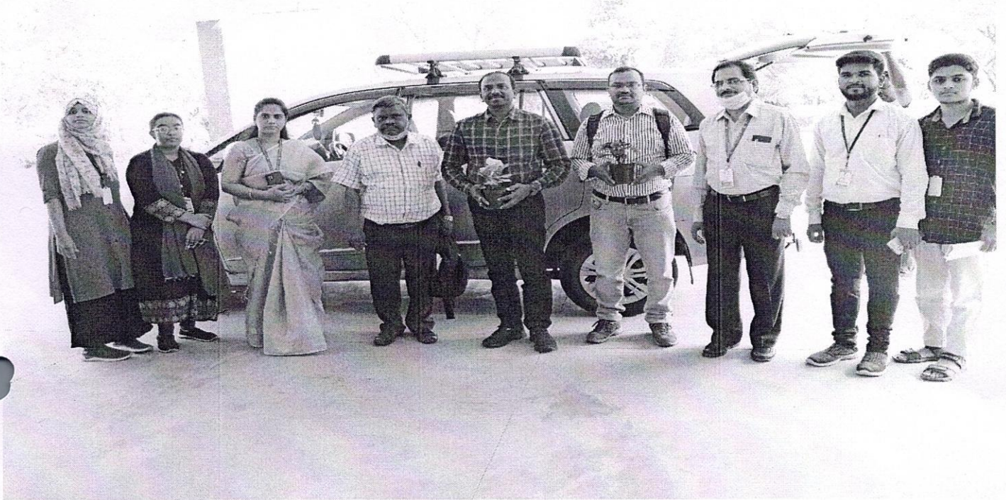
Grand welcome to the Chief Guest by the Principal & Alumni Committee.